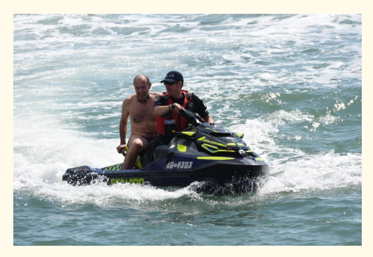
Swimmer brought back to the safety of the shore on our PWC